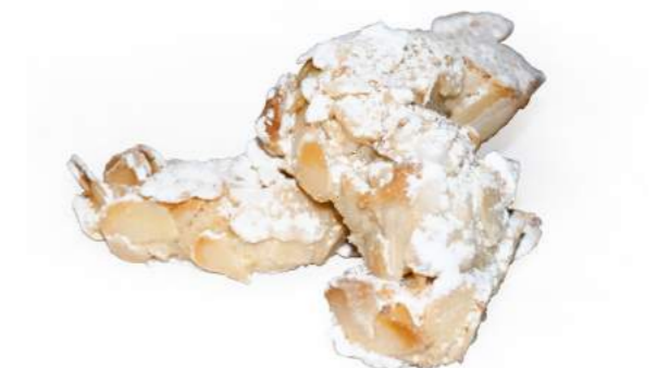
ALMOND BISCUITS WITH FLAKES