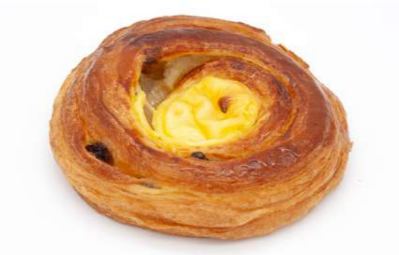
GIRELLA WITH RAISIN AND CREAM