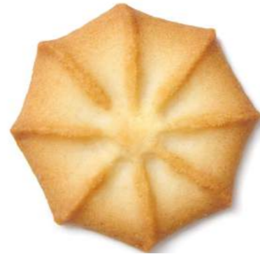
SHORTCRUST AND SUGAR