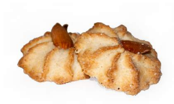
ALMOND BISCUITS WITH ALMOND