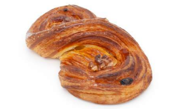
BRAID WITH RAISIN AND NUTS