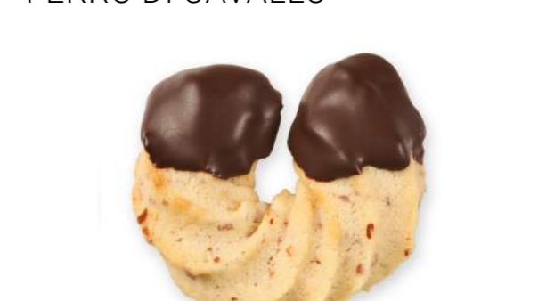
FERRO DI CAVALLO