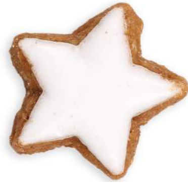
WHIRLIGIG BISCUIT DOUBLE TASTE