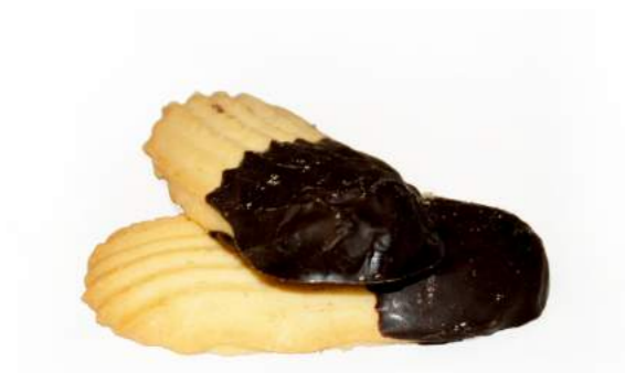
GLAZED SHORT BREAD