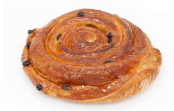
GIRELLA WITH RAISIN