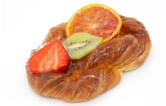
BRAID WITH FRUITS