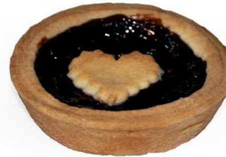
CREAM AND CHOCOLATE PIE