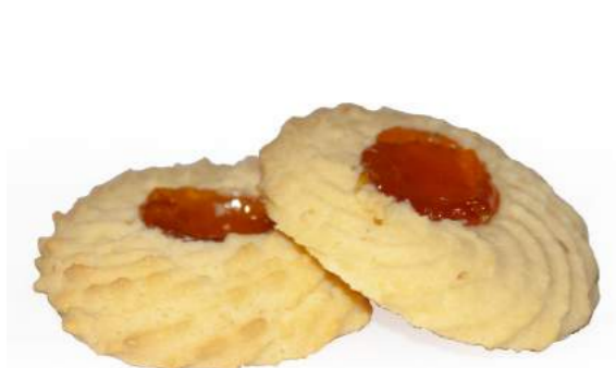
SHORTCRUST AND MARMALADE