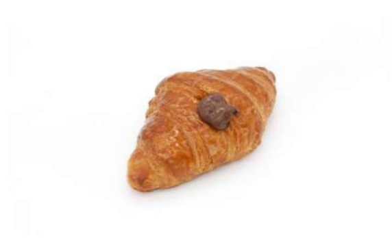
MINI CROISSANT WITH CHOCOLATE