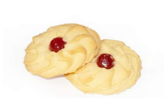
SHORTBREAD AND CHERRY