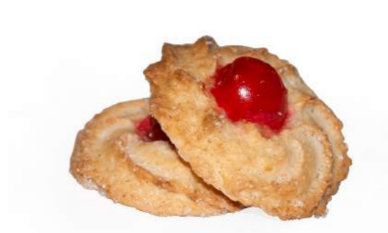
ALMOND BISCUITS WITH LITTLE CHERRY