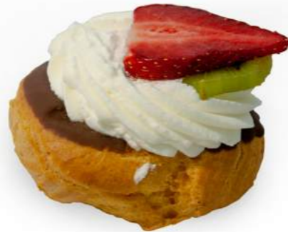
CREAM PUFFS WITH CREAM