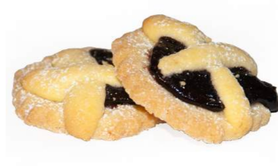
BISCUITPIE WITH BARRIES