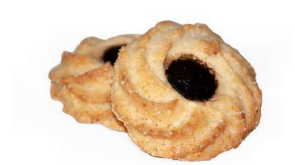
ALMOND BISCUITS WITH BARRIES